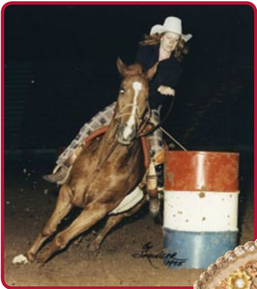
Above: Reba in a 1975 barrel racing competition in Fort Smith, Arkansas.

Begin by asking your students what they know about Reba McEntire. Once students have shared, read Reba's biography (see back page) to the class or pass out copies for the students to read themselves. Then, select the activities that best correspond to your subject area.