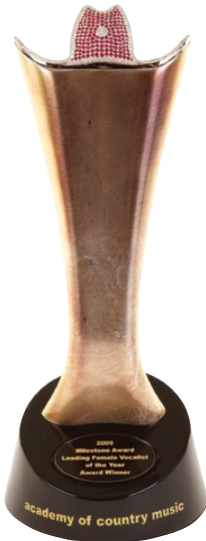
ACM Milestone Award, given to Reba in 2005 in recognition of being named Top Female Vocalist a record seven times.