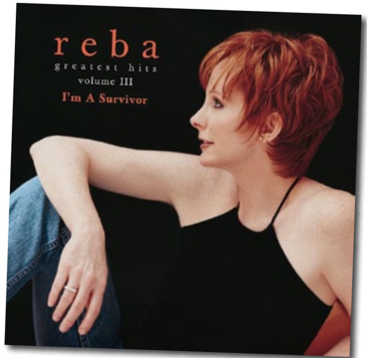
Cover of Reba's 2001 album Greatest Hits Vol. 3: I'm a Survivor .