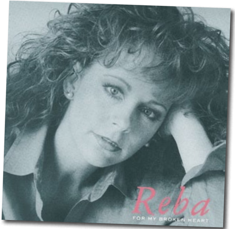
Cover of Reba's 1991 album For My Broken Heart .