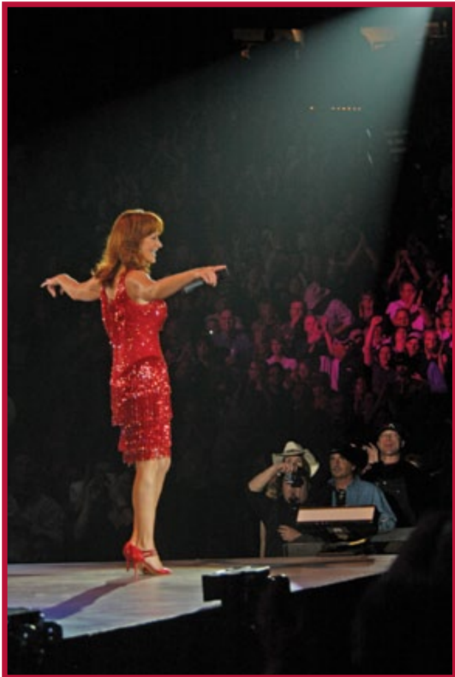
Reba in concert, 2010.