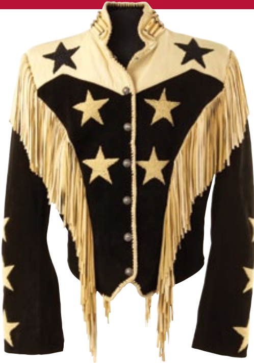
Western jacket worn by Reba in Annie Get Your Gun .

Begin by asking your students what they know about Reba McEntire. Once students have shared, read Reba's biography (see back page) to the class or pass out copies for the students to read themselves. Then, select the activities that best correspond to your subject area.